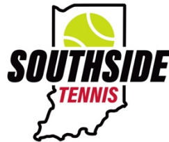
Southside Tennis @ CG CTA