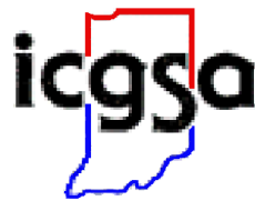
Indiana Coaches of Girls Sports Association